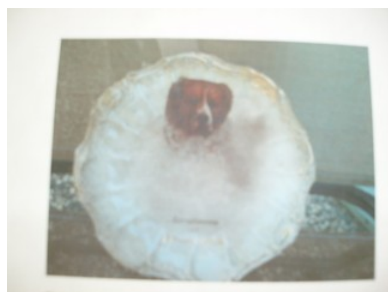
A close-up of the plate.