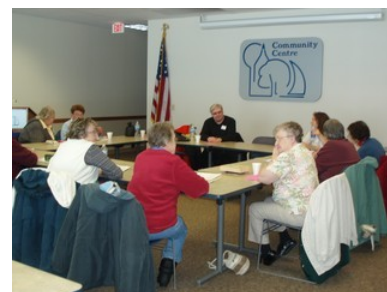
Here's the group